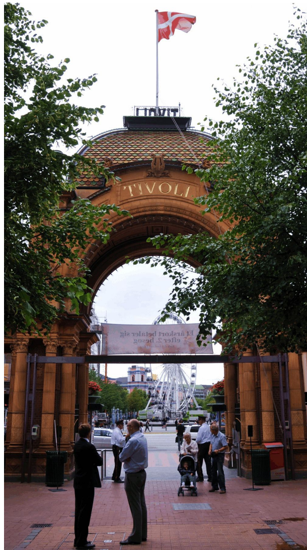
This will be the starting point of your next "Monte".

12:00 - 18:00: You may park your rally cars and service vans overnight for free in the secured parking-area in Tivoli.