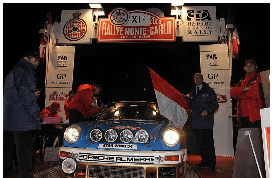
And if you get as far as this you have done really well.