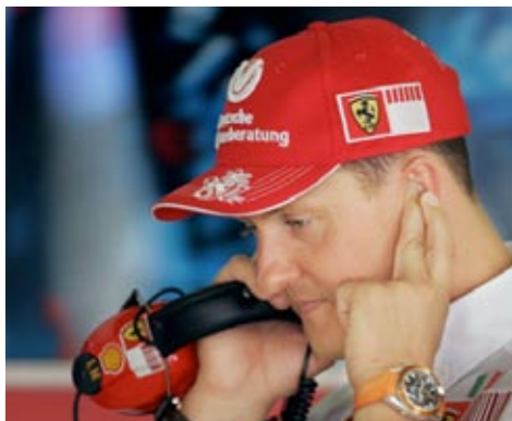
Do you remember this guy? This weekend he will drive one of his old F1 cars at the Nürburgring.

If I had to pick only one Ferrari event this year to visit, I would go for Ferrari Racing Days at Nürburgring this coming weekend.