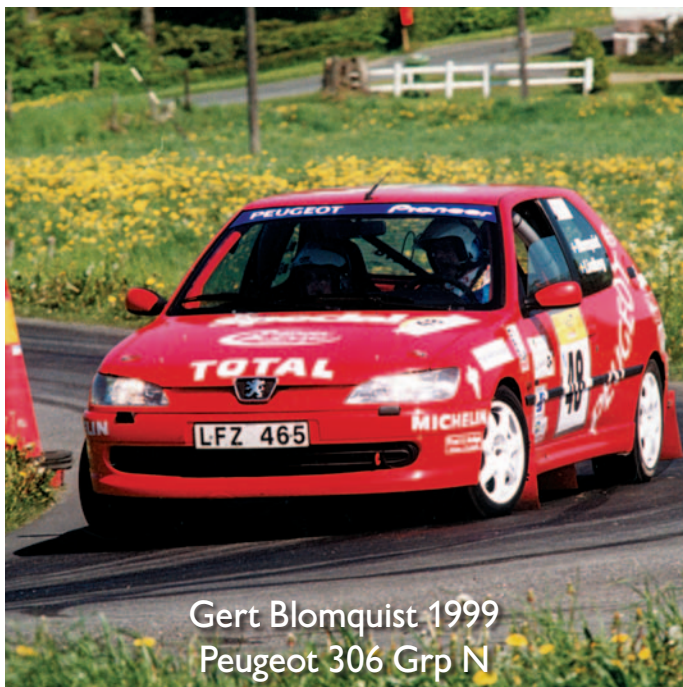
Gert Blomquist 1999 Peugeot 306 Grp N